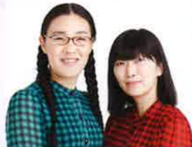
Tanpopo (Stage MC)

*Please understand that admission limits may be imposed for safety purpose. *Performers may be subject to change without notice in certain situations.